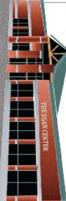
THE EGAN CENTER